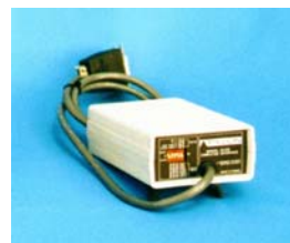
PPT-1 and CI-55